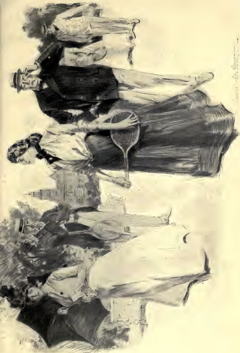
Illustration of a group of people in late 19th-century attire, including a man in a dark suit and hat, a woman in a light dress and dark skirt holding a tennis racket, and another woman in the foreground.